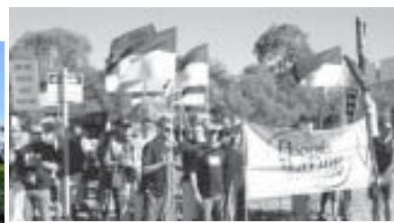
PLWHA Victoria, members, family and friends at Pride March